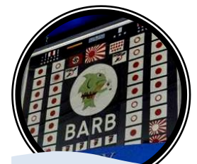
5. USS Barb Battle Flag