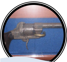
4. Paul Foster Revolver