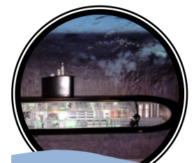
11. City Beneath the Sea

10. This tartan was designed and named for the Polaris missile and reflects the many years the US Navy had a submarine base at Holy Loch , Scotland.