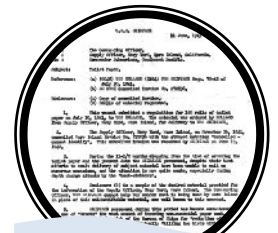
9. USS Skipjack Memo

8. The crews of the Skate and the Seadragon played the world's first polar baseball game.