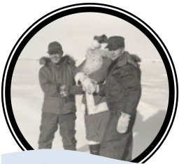
8. Greetings from the North Pole

7. This elevator was especially constructed for President Kennedy 's visit aboard SSBN 610 due to his back injury.