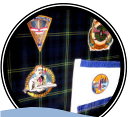
10. Polaris Tartan

10. This tartan was designed and named for the Polaris missile and reflects the many years the US Navy had a submarine base at Holy Loch , Scotland.