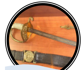
3. Howard Gilmore Dress Sword