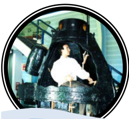
6. Bushnell's Turtle

1. Here the helmsman steers the rudder while the plansman operates the stern plans.