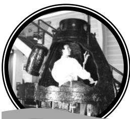
6. Bushnell's Turtle

Born in Putnam, CT he earned the Medal of Honor for saving a fellow shipmate . By refusing to abandon his companion he demonstrated the value of being Loyal