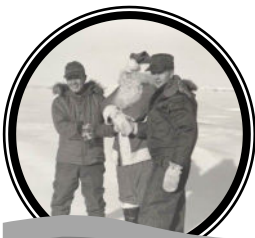
8. Greetings from the North Pole

Choose the object, story or person you learned about in the museum that you think best represents the Boy Scout Motto, “Be Prepared”, and explain why you think so here: