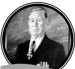
12. VADM Levering Smith

This black and white doll was used as a simple Clock by the crew of the Seafox. By assisting the crew in this way we can see that even a doll can demonstrate the value of being Helpful