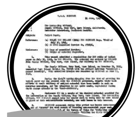
9. USS Skipjack Memo