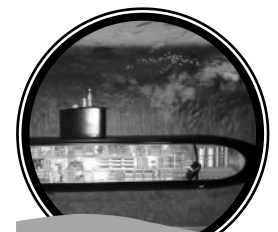
11. City Beneath the Sea