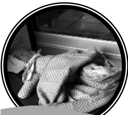
10. Black and White Doll

The crews of the Skate and the Seadragon played the world's first polar baseball game and greeted Santa Claus. By having fun, visiting each other and the North Pole's most famous citizen, these crews demonstrated the value of being Friendly