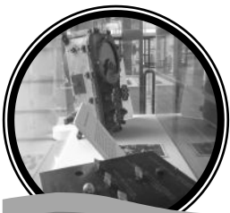
2. Harman Automatic Steerman Device

Welcome. During your journey through the museum this scavenger hunt will help you learn how the 12 values found in the Scout Law tie into the history and heritage of the U.S. Navy Submarine Force. For each object fill in the blank with information found in the exhibits and write in what value is best represented. (Hint: Each is only used once)