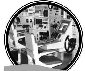
1. Ship Control Panel

Here the helmsman steers the rudder while the plansman operates the stern plans. As they are maneuvering the submarine, but cannot see where it is going it is important they follow orders, demonstrating the value of being obedient