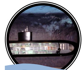
11. City Beneath the Sea

10. This tartan was designed and named for the Polaris missile and reflects the many years the US Navy had a submarine base at _____ Scotland.