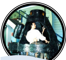
6. Bushnell's Turtle

6. Sergeant _____ of Lyme, CT was chosen to operate David Bushnell's Turtle during its attack on the HMS _____.