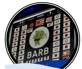
5. USS Barb Battle Flag

5. CDR Eugene Fluckey commanded the USS Barb during WWII. The train depicted on the flag represents _____ making them the only Allied forces to invade the _____.