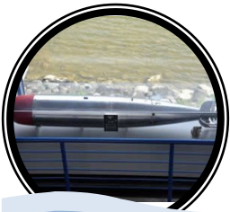
2. Whitehead Torpedo

Welcome to the Submarine Force Museum. This scavenger hunt is meant to guide you towards some of the unique items in our collection. Discovering more about the history and heritage of the U.S. Navy Submarine Force in the process. For each object fill in the blank with information that can be found in our exhibits.