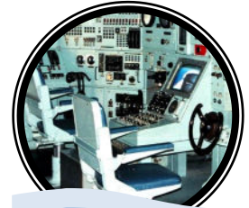
1. Ship Control Panel

1. Here the _____ steers the rudder while the _____ operates the stern plans.