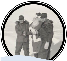
8. Greetings From the North Pole

7. This elevator was especially constructed for President _____'s visit aboard SSBN 610 due to his back injury.