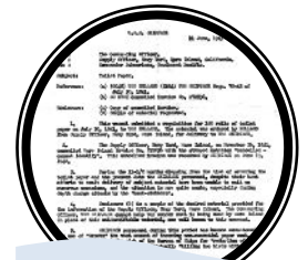
9. USS Skipjack Memo

8. The crews of the _____ and the _____ played the world's first polar _____ game.